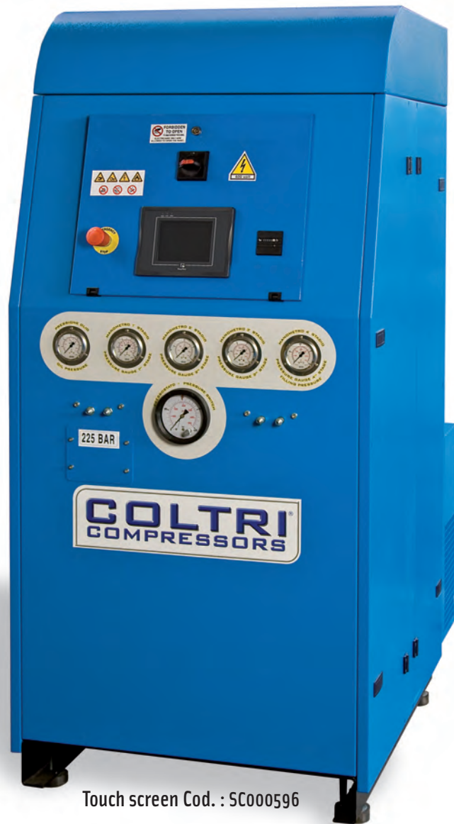
Touch screen Cod. : SC000596