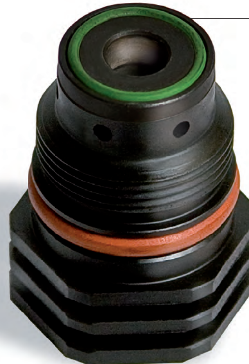
NEW DISCHARGE VALVE 2nd STAGE CODE 13-02-0049/R