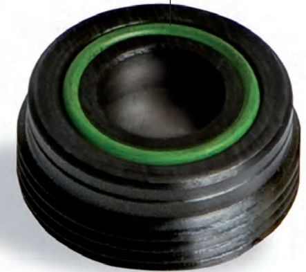
NEW SUCTION VALVE 2nd STAGE CODE 13-02-0044/R

AEROTECNICA COLTRI® S.p.A. via Colli Storici 177 25010 San Martino della Battaglia Brescia - ITALY Tel: +39.030.99.103.01 +39.030.99.102.97 Fax: +39.030.99.10.283 www.aerotecnicacoltri.it sales@coltrisub.it